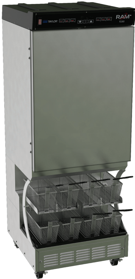
Fryer Baskets Sold Separately